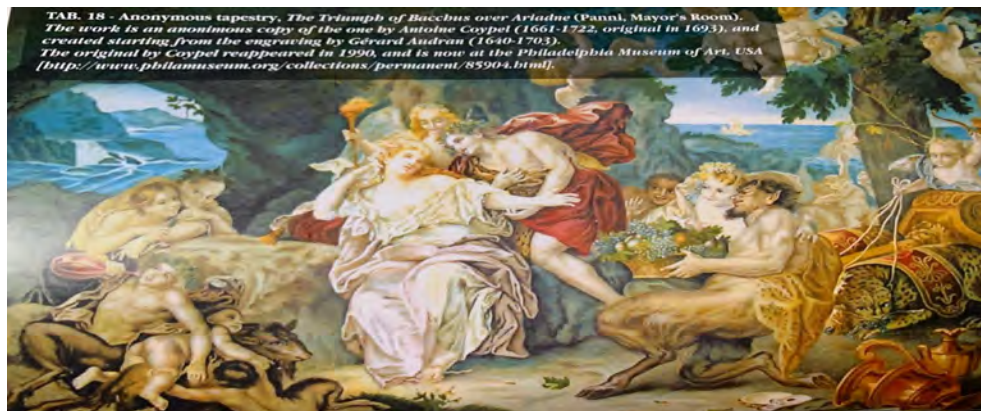
TAB. 18 - Anonymous tapestry, The Triumph of Bacchus over Ariadne (Panni, Mayor's Room). The work is an anonymous copy of the one by Antoine Coypel (1661-1722, original in 1693), and created starting from the engraving by Gérard Audran (1686-1763). The original by Coypel reappeared in 1980, and is now at the Philadelphia Museum of Art, USA [ http://www.philamuseum.org/collections/permanent/85904.html ].

In our last newsletter we mentioned the on-going work of an English translation of "Sali Che Ti Porto A Panni". The book about Panni's origin – coupled with history, art, music, myths and traditions is finally on its way from Panni to our Society. Copies will be available soon.